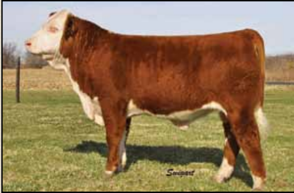
Lot 22 — BH Solid Oak 02Y ET