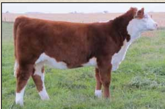
Lot 56 — CPH Joyful Antics 995Y