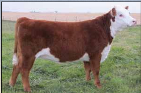
Lot 41 — CPH Miss Enchantment 461Y