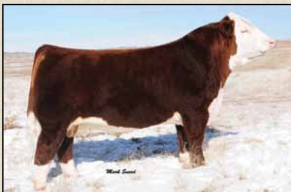
CRR About Time 743 — Sire of Lots 6, 7, 23, 25, 28, 29, 32, 40, 46 & 52.