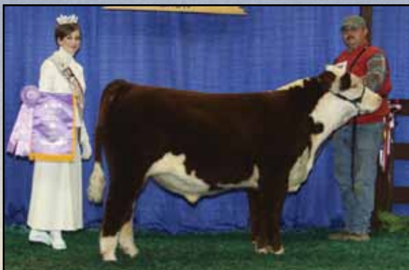
Lot 28 — ABRA 743 Prince Albert 16Y