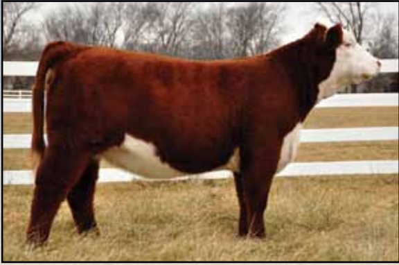
Lot 49 — JJB Firework 7Y