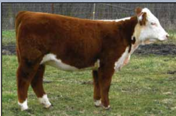
Lot 55 — VCF S44 Marly 07Y