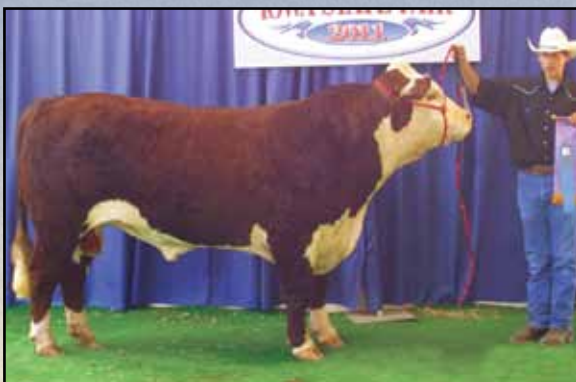
Lot 1 — Heck Thundershine 1W