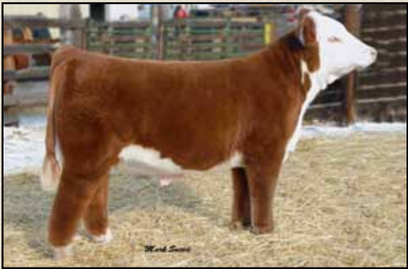
Purple Milsap 45S — Sire of Lot 54