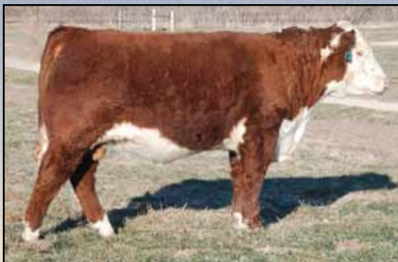
Lot 19 — PHH PCC 651 Jagger 110