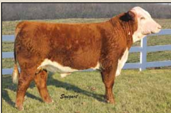
Lot 20 — LCC Typhoon 106