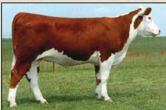
Lot 34 — STAR KKH SSF Keyja'Vu 300U ET