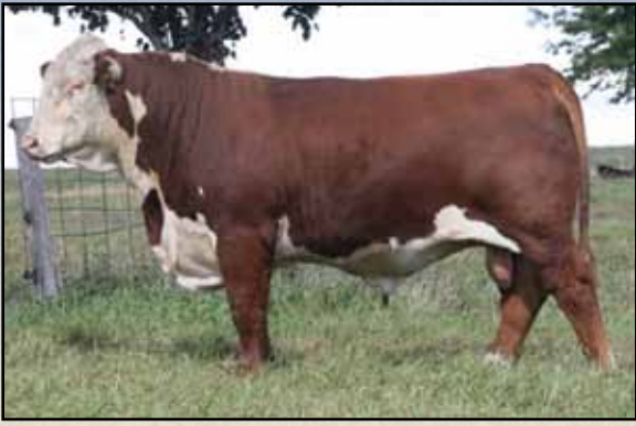
Lot 11 — WS Grand Mark 644 0169