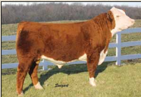
Lot 15 — LCC Timeout 0177