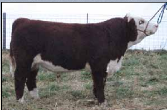
Lot 23 — DEP Sudden Impact ET