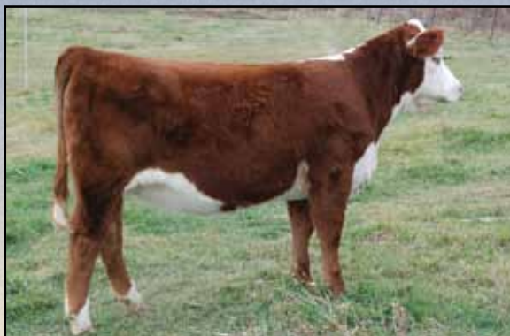
Lot 43 — PHH PCC 527 Eva 129