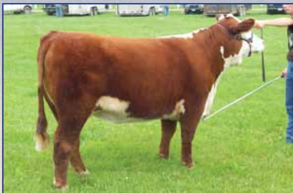
Lot 61 — K7 2072 Lass 864