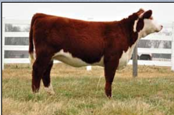
Lot 51 — JJB Show Goes On 8Y