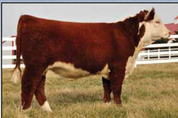
Lot 33 — JJB Forrest 5Y