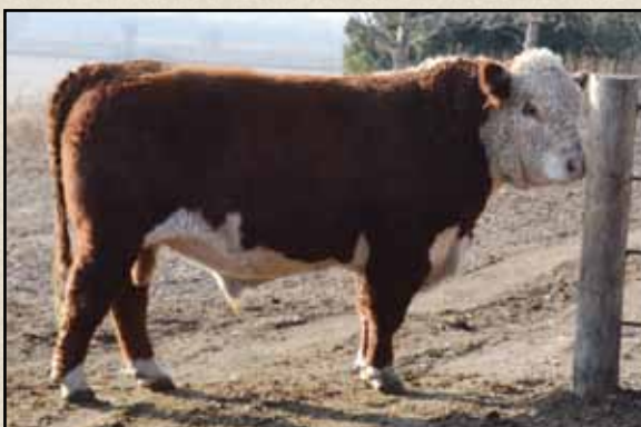
Lot 2 — JR CCF Superstar W0985