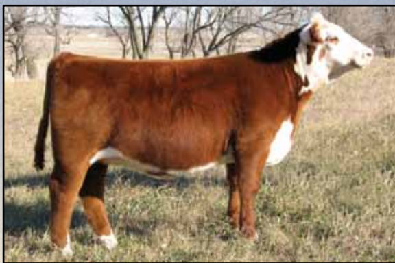
Lot 39 — MSF Miss Outcross 3Y ET