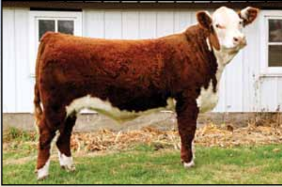
Lot 17 — MGF Yegor 101Y ET