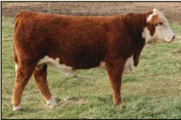
Lot 18 — PHH PCC 844 Revolution 109