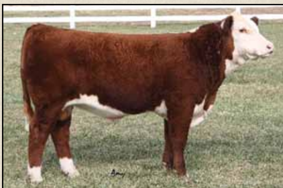
Lot 24 — TFL DHF Classified Y3