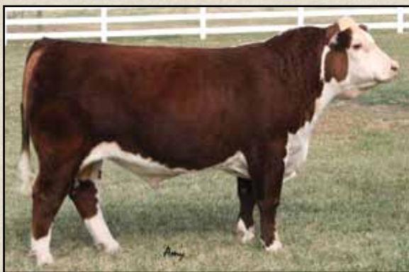
Lot 10 — EFBEEF 2013 Goodfellow X610