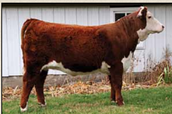
Lot 44 — MGF Yenay 102Y