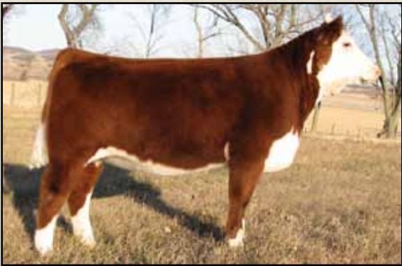
Lot 46 — MSF I Love Lucy 8Y ET