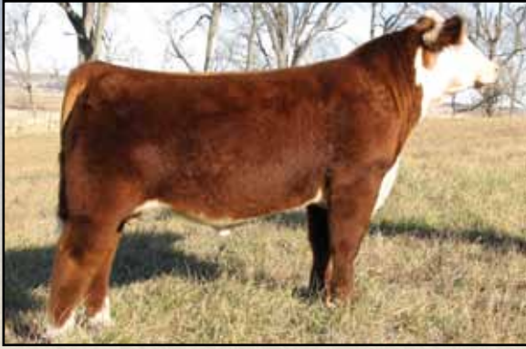
Lot 21 — MSF Mayhem 7Y ET