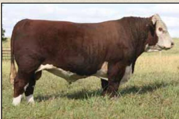
Lot 4 — WS Intense Duke 512 05