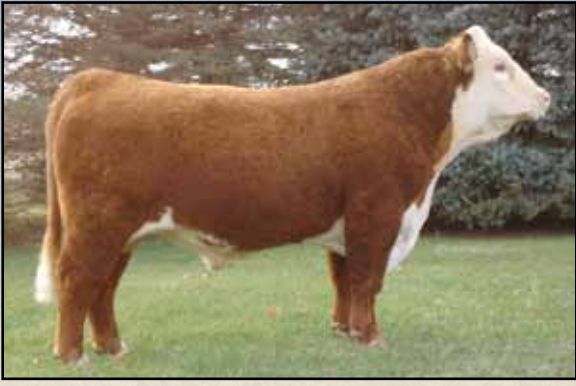
Lot 5 — SL T44 Excel 06