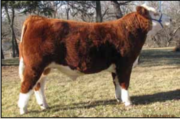
Lot 25 — SS Time Machine 03Y