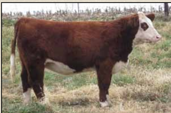
Lot 40 — DEP Ms Iusabel T16 ET