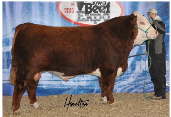
High-Selling Bull -- $10,500 WS Battle 0161 7191 Consigned by Wiese & Sons