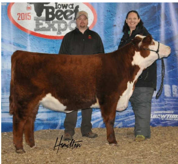
High-Selling Female -- $23,000 CPH Rosemary 403B ET Consigned by Casteel Polled Herefords