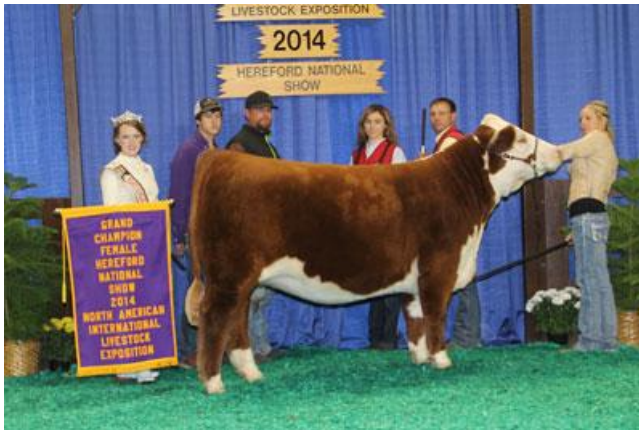
Purple Jaxon 36A ET