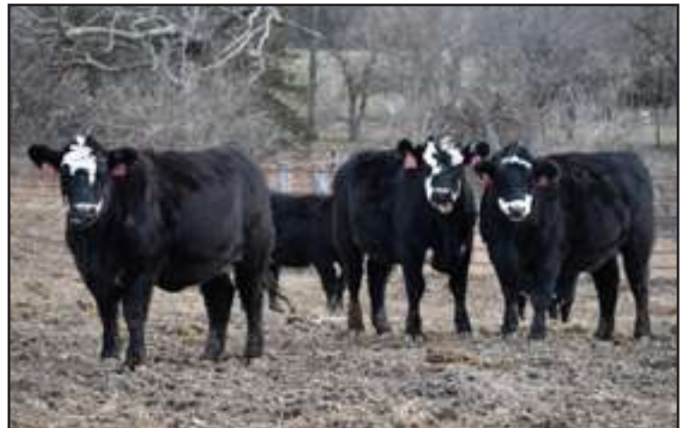
F1 Baldie Heifers

115 Head Black Heifers Bred to BR Red Baron 8300F 7098 1786ET (44358754). Due to start Feb 14, 2026.