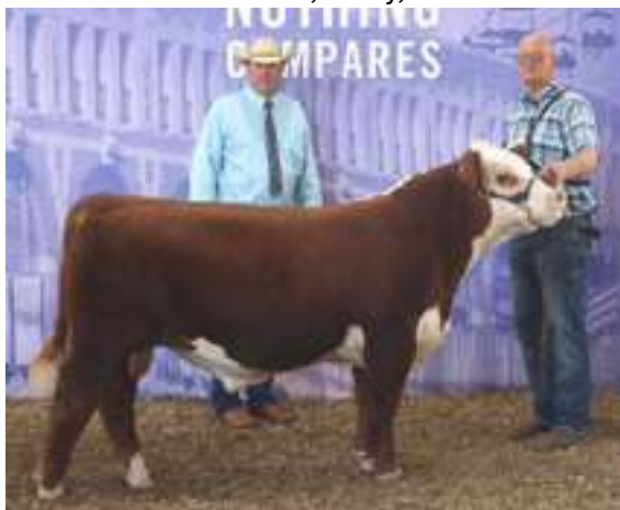
Senior Bull Calf & Grand Champion Bull