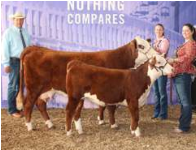
Reserve Champion Cow-Calf Pair JMP RJ Malibu Smoke S1L Knapp Cattle Company, Clarksville, IA