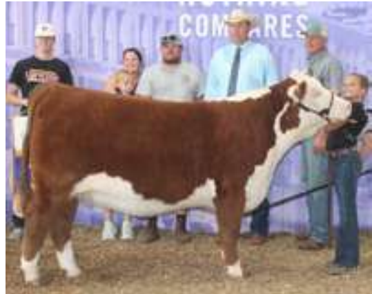
Spring Yearling, Grand & Iowa Champion Horned Heifer