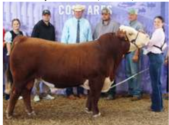
Yearling, Reserve Grand & Iowa Champion Bull

TJ 601 Tomahawk 2414 Tjardes Farms, Fooseland, IL