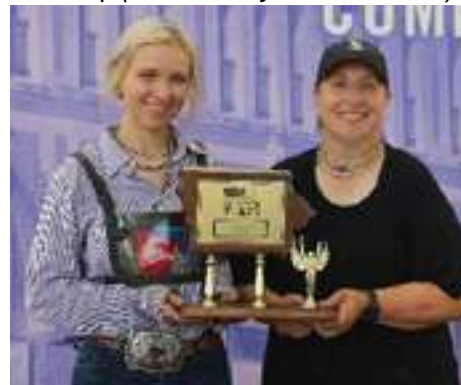
TS Cattle Co., Centerville, IA