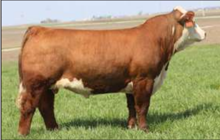
F Monument 443 – Baldy Making Specialist

••••• DEC. 3, 2025 • KEOSAUQUA, IOWA •••••