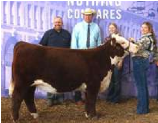
Intermediate Yearling & Grand Champion Polled Heifer