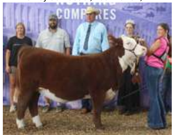
Senior Heifer Calf, Reserve Grand & 4-H Champion Horned Heifer