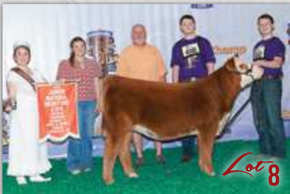
WILDCAT LEMONADE 502 ET January Polled • Lady Luck x Premier JNHE Reserve Division 1 Bred & Owned