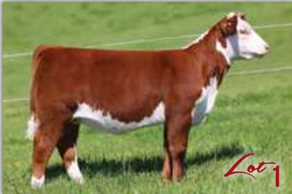
WILDCAT PROVIDENCE 5347 ET March Horned • Patience x Marksman