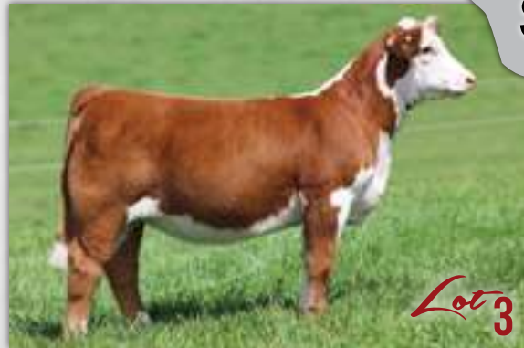
WILDCAT PROSPERITY 5027 ET January Polled • Patience x High Roller