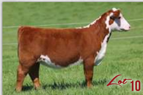
WILDCAT VERSACE 5068 ET March Polled • Percy x Red River

CAN'T BE THERE IN PERSON, join us online LiveAuctions.TV