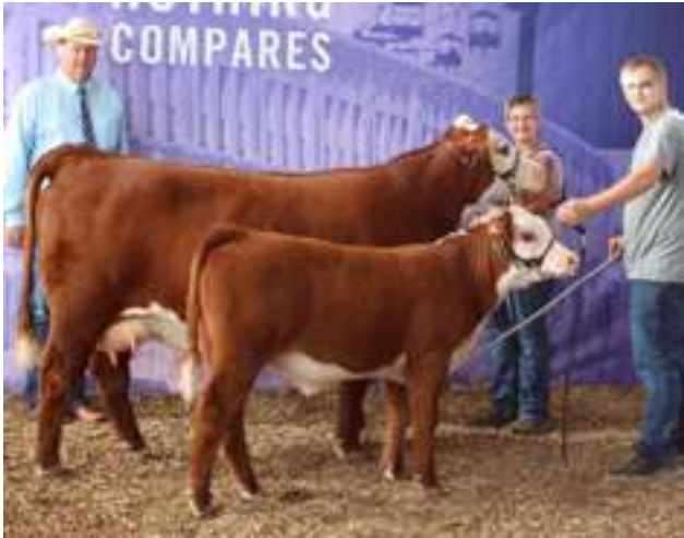
Champion Cow-Calf Pair (8 shown) Gathering Leader 333 Rainbow Herefords, Volin, SD