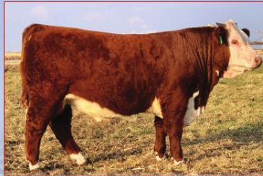
Sired by NJW 135U 10Y HOMETOWN 27A CE 3.7 / BW 2.4 / WW 52 / YW 87 REA 0.41 / MARB 0.12 / CHB $100