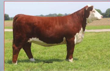
Sire: GA WSC UNLEASHED KEEPSAKE 3A CE -2.3 / BW 4.5 / WW 58 / YW 89 REA 0.53 / MARB 0.01 / CHB $112 Due in Spring with heifer pregnancy to BLL LCC NEW GLARUS 4130