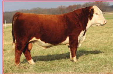
Sired by UPS SENSATION 2296 ET CE 1.2 / BW 3.0 / WW 66 / YW 99 REA 0.58 / MARB 0.44 / CHB $122