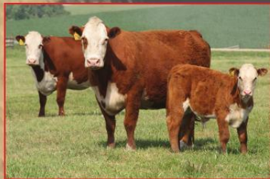
Selling choice of entire maternal herd of Wiese & Sons.