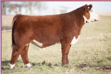
Sired by C DOUBLE YOUR MILES 6077 ET CE 1.2 / BW 3.3 / WW 57 / YW 88 REA 0.64 / MARB 0.02 / CHB $119