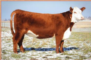
Sired by UU SENSATION 4043 CE 5.2 / BW 3.4 / WW 61 / YW 93 REA 0.38 / MARB 0.08 / CHB $99 AI'd to GR ON TARGET 2625 on 4/25/18