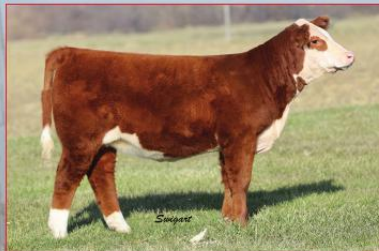
Sired by RST TIMES A WASTIN 0124 Born 6/14/18 CE 1.4 / BW 1.7 / WW 56 / YW 87 REA 0.33 / MARB 0.03 / CHB $103