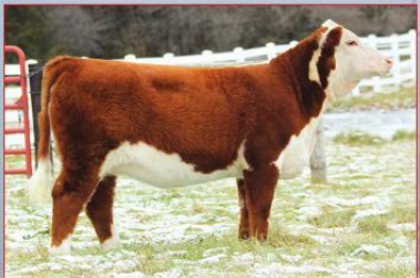
Sired by CHURCHILL PILGRIM 632D ET Born 2/01/18 CE 0.7 / BW 4.9 / WW 65 / YW 105 REA 0.38 / MARB 0.11 / CHB $111